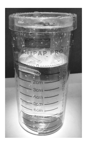
Fill the canister with water to the 0 cm line and set it into the metal bracket.