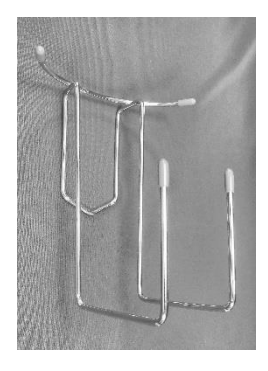
Slide the metal bracket into the pole clamp